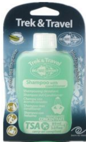
Trek & Travel LIQUID CONDITIONING SHAMPOO 89ML