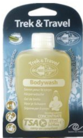
Trek & Travel LIQUID BODY WASH 89ML