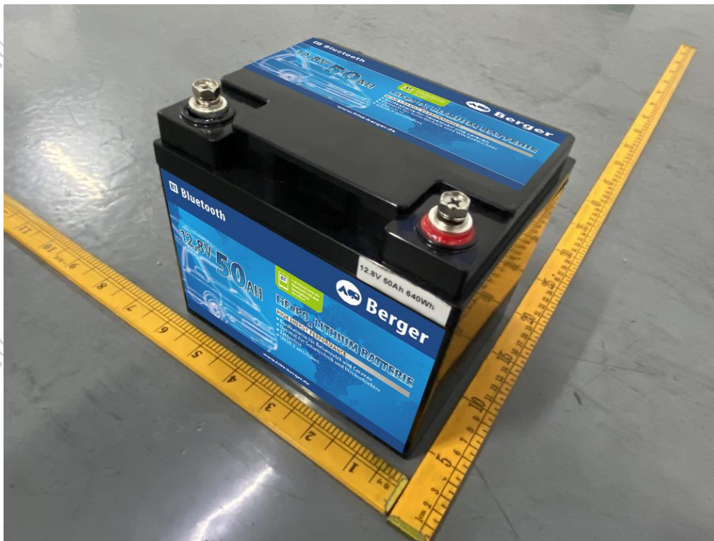
Figure 1 Overall view I of battery (外观图I)