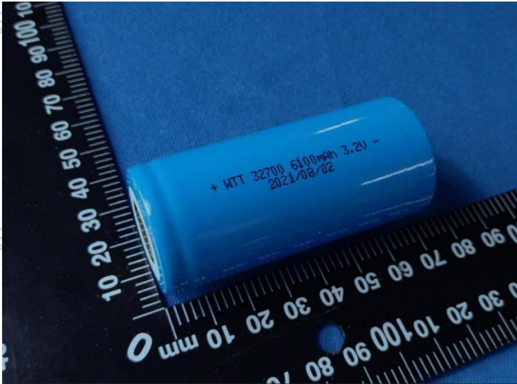
Figure 3 Overall view of cell (电芯图)